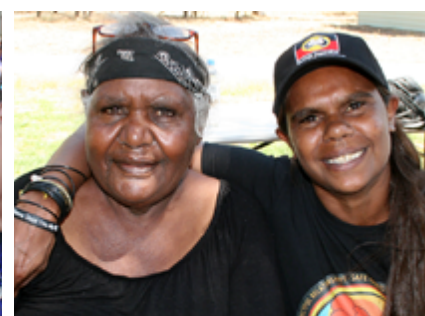
Celebrations at Alukura