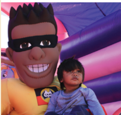
Cuz Congress at the opening of the Arrwekle akaltye-irretyeke apmere Early Childhood Learning Centre