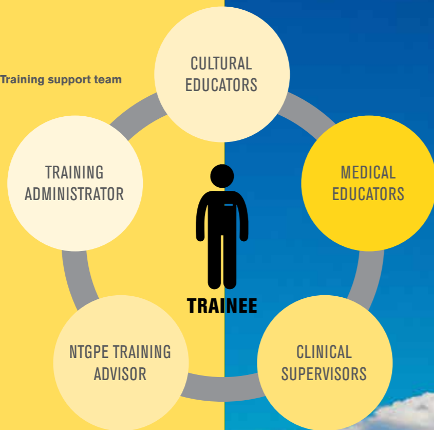
Figure 1: The Advanced Training support team